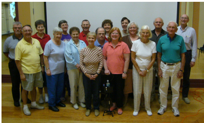
Sun City Center CERT Class March 2008

The first Sun City Center Community Emergency Response Team (CERT) Class for 2008 graduated on March 22 nd at the Kings Point South Clubhouse. The four Saturday course program educates class members about disaster preparedness for hazards that may impact our area and trains them in basic disaster response skills, such as fire safety, light search and rescue, team organization, and disaster medical operations. Using the training learned in the classroom and during exercises, CERT members can assist others in our neighborhood following an event when professional responders are not immediately available to help. CERT members also are encouraged to support